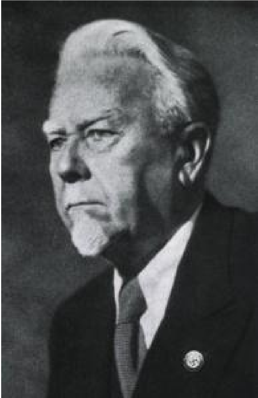
Ernst Rudin, the primary architect of Nazi Germany's Eugenics programs