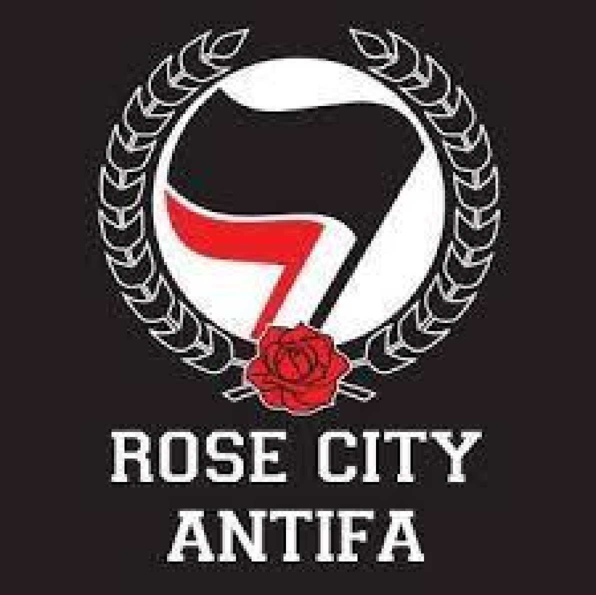
Rose City Antifa