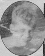
At age 11, Ted was an extremely bright youngster

'Ted never found a woman — his love for nature somehow turned into hatred'