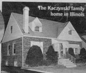
The Kaczynski family home in Illinois