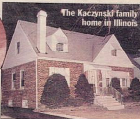
The Kaczynski family home in Illinois