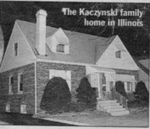
The Kaczynski family home in Illinois