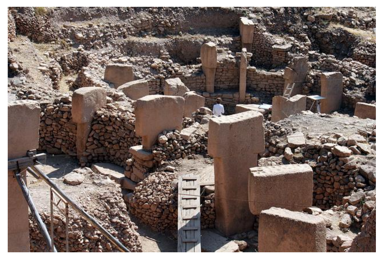
The excavations at Göbekli Tepe.

Still more astonishing are the stone temples of Göbekli Tepe, excavated over twenty years ago on the Turkish-Syrian border, and still the subject of vociferous scientific debate. Dating to around 11,000 years ago, the very end of the last Ice Age, they comprise at least twenty megalithic enclosures raised high above the now-barren flanks of the Harran Plain. Each was made up of limestone pillars over 5m in height and weighing up to a ton (respectable by Stonehenge standards, and some 6,000 years before it). Almost every pillar at Göbekli Tepe is a remarkable work of art, with relief carvings of menacing animals projecting from the surface, their male genitalia fiercely displayed. Sculpted raptors appear in combination with images of severed human heads. The carvings attest to sculptural skills, no doubt honed in the more pliable medium of wood (once widely available on the foothills of the Taurus Mountains), before being applied to the bedrock of the Harran. Intriguingly, and despite their size, each of these massive structures had a relatively short lifespan, ending with a great feast and the rapid infilling of its walls: hierarchies raised to the sky, only to be swiftly torn down again. And the protagonists in this prehistoric pageant-play of feasting, building, and destruction were, to the best of our knowledge, hunter-foragers, living by wild resources alone.