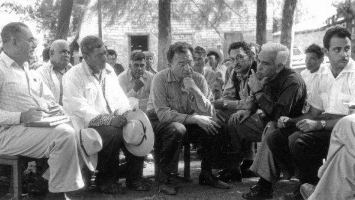
Fromm and his students in Chiconuac, Mexico, where, in the sixties, they planned a socio-psychological field-research project.