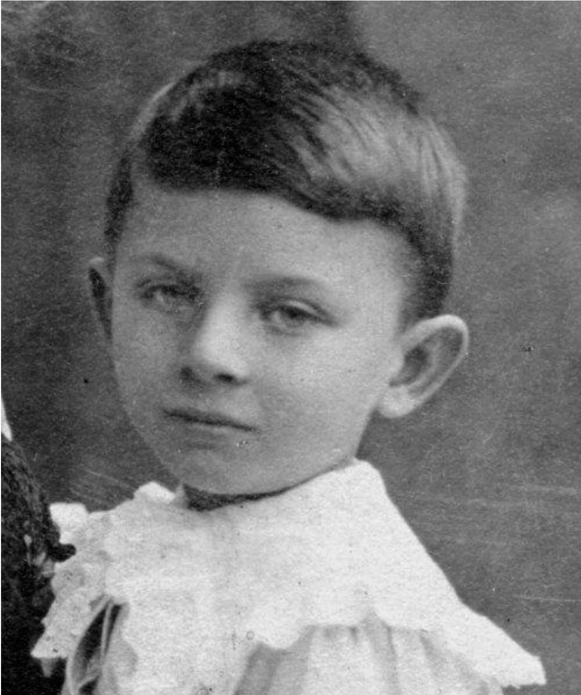
With photography becoming popular at the turn of the twentieth century, young Fromm's picture was often taken.