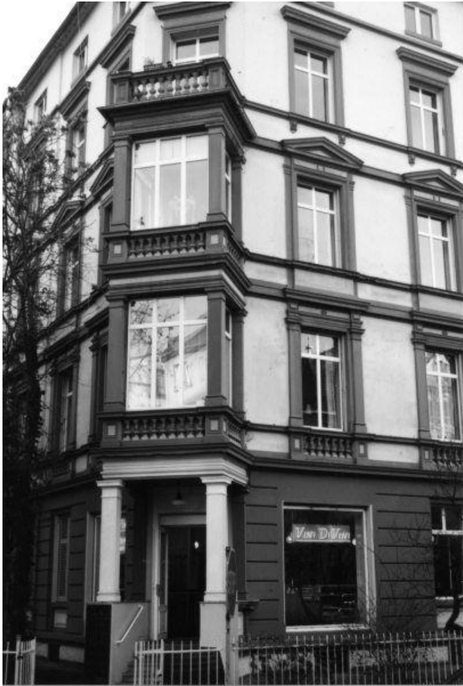
Fromm's childhood home at 27 Liebigstrasse in Frankfurt.