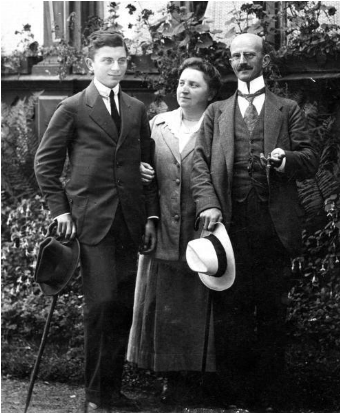
A complete Fromm family picture taken in Germany during Fromm's Wöhlerschule student days.