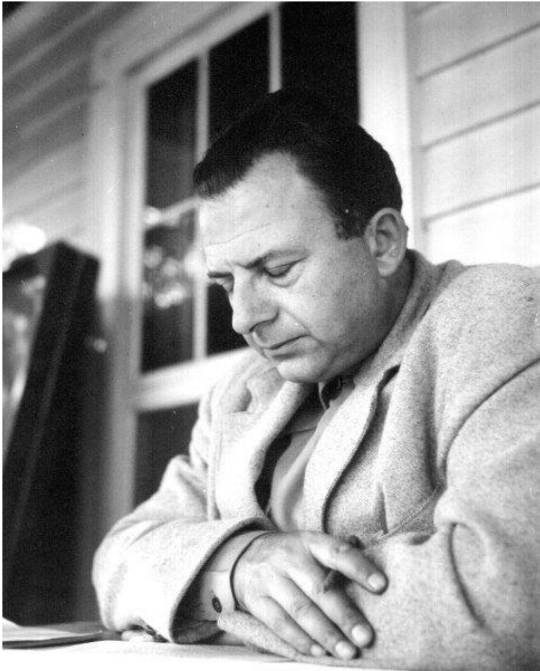
Fromm made it a priority to meditate and to analyze his dreams every day. Here he is meditating in his home in Cuernavaca, ca. 1965.