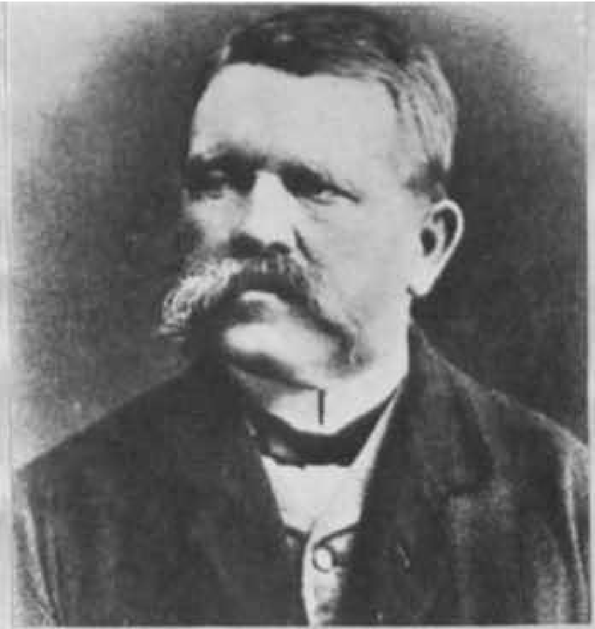
Alois Hitler — Hitler's father. Note resemblance to Hindenburg.