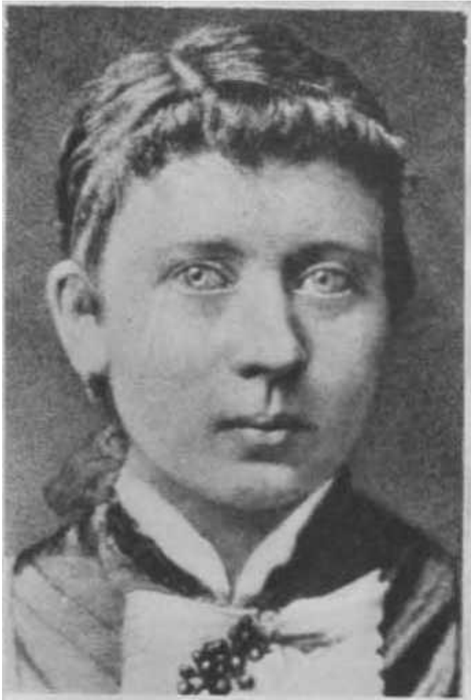
HITLER'S MOTHER