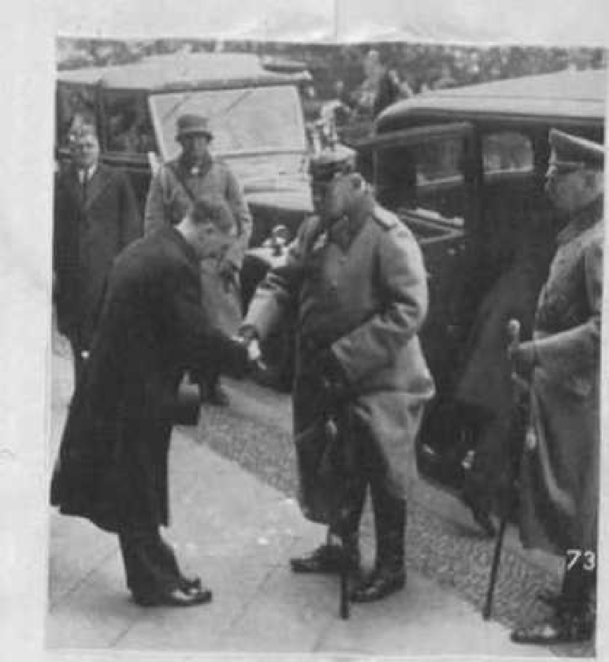
Note the subservience of Hitler's bow.