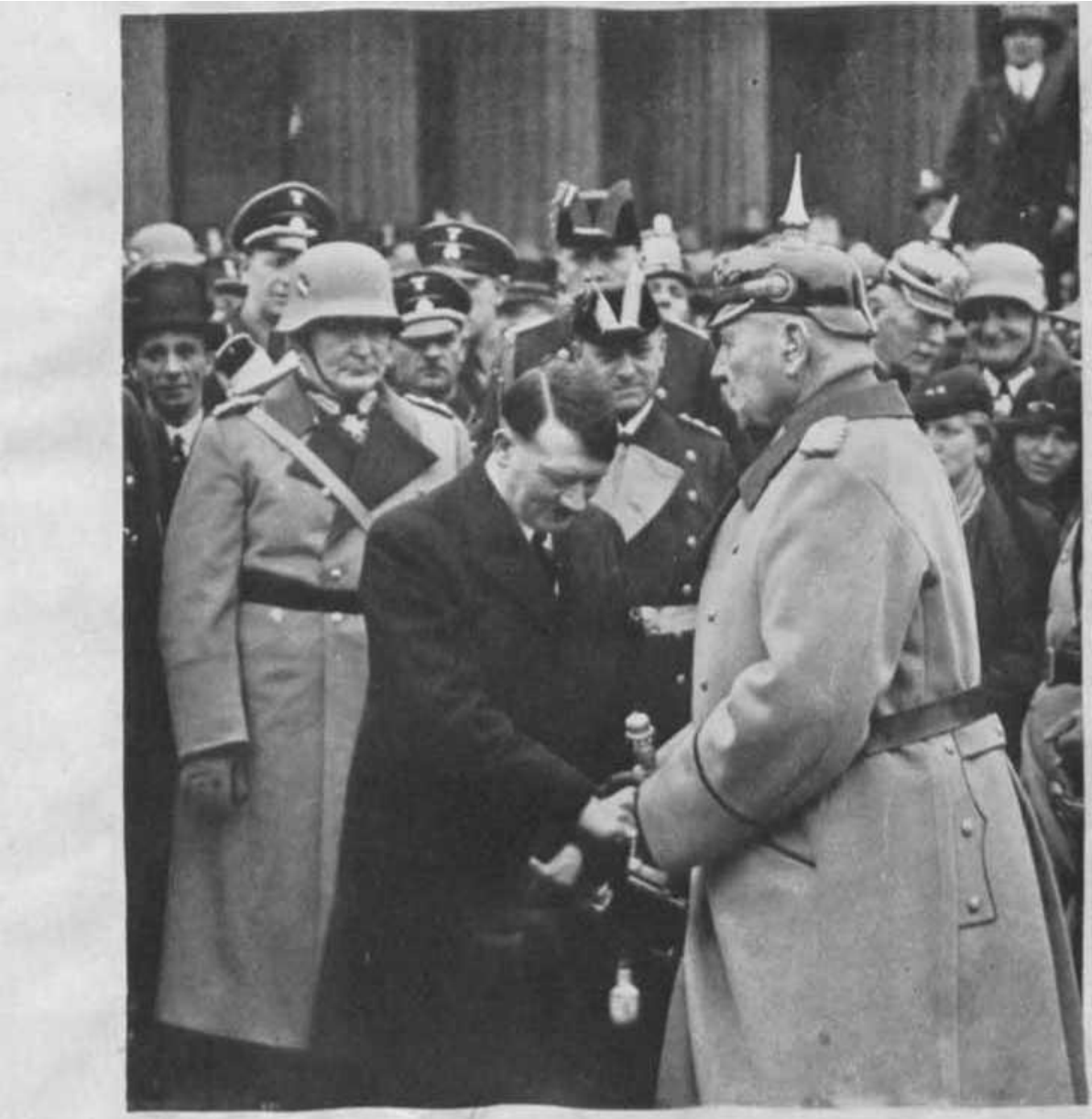
Hitler and President Hindenburg on the Day of Potsdam March, 1933