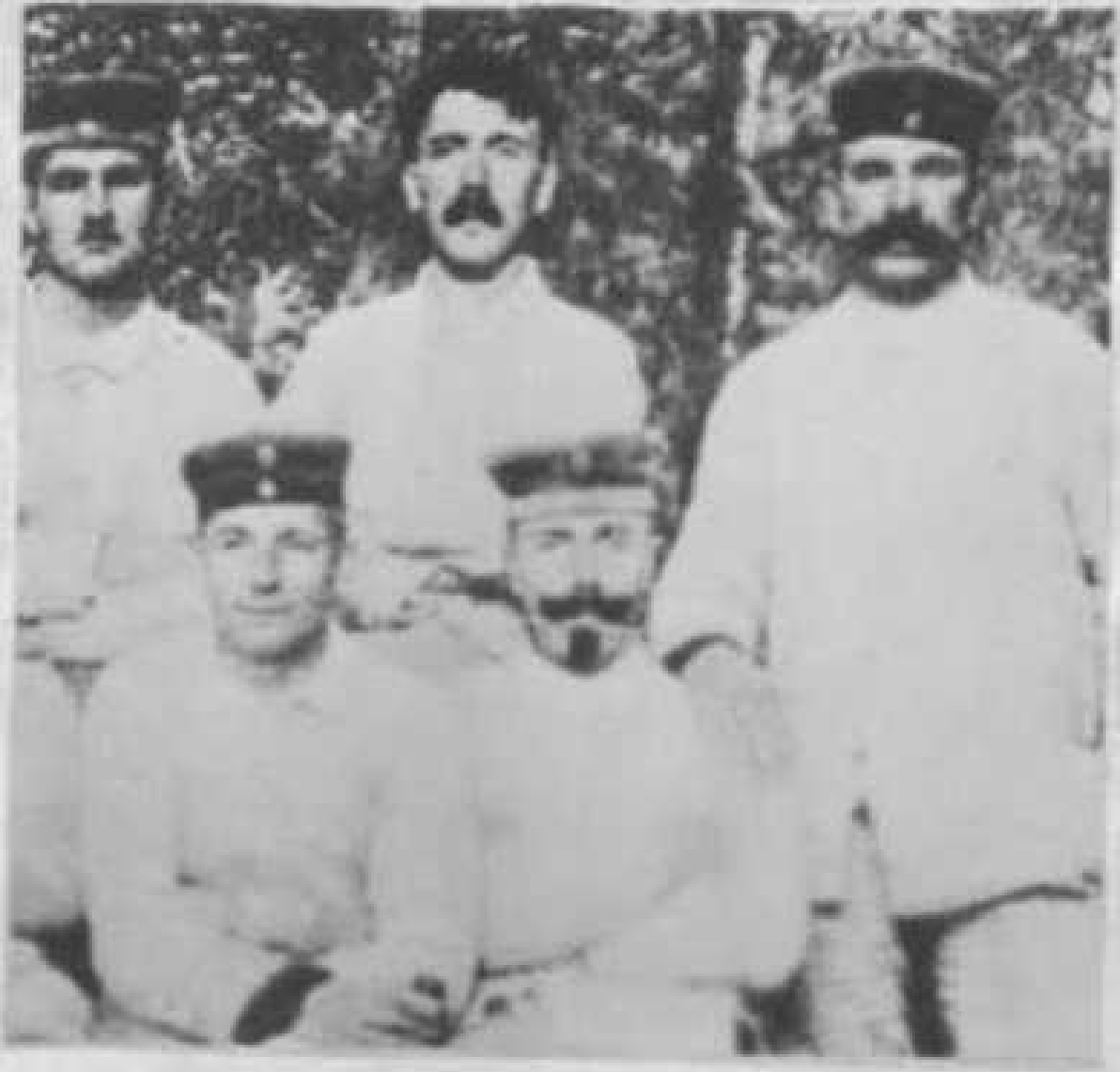
Hitler with fellow patients at Pasewalk, 1918