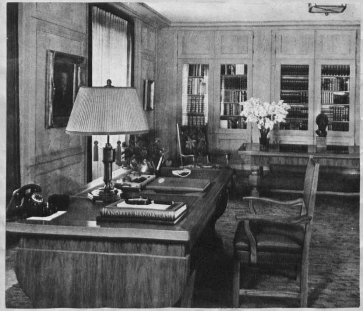
Hitler's Study at Berghof, Desk faces portrait of Alois Hitler.