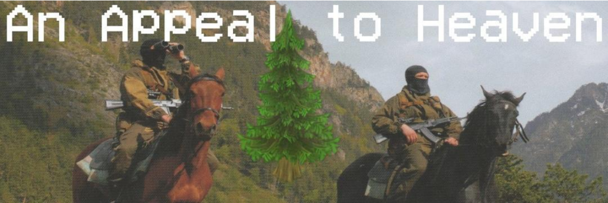
A graphic made by the pine tree community.