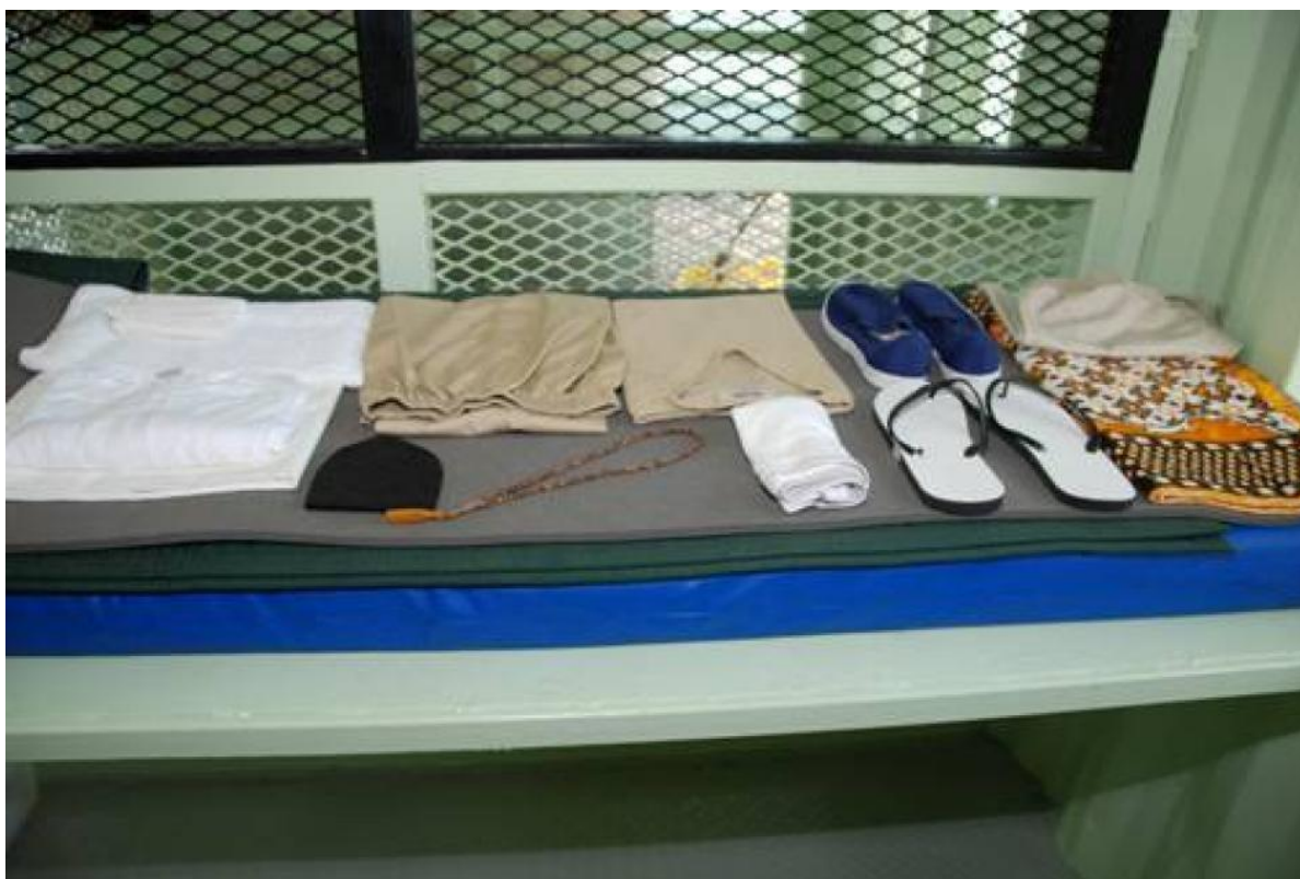
Camp 1 cell, showing the wire mesh cell walls/windows.