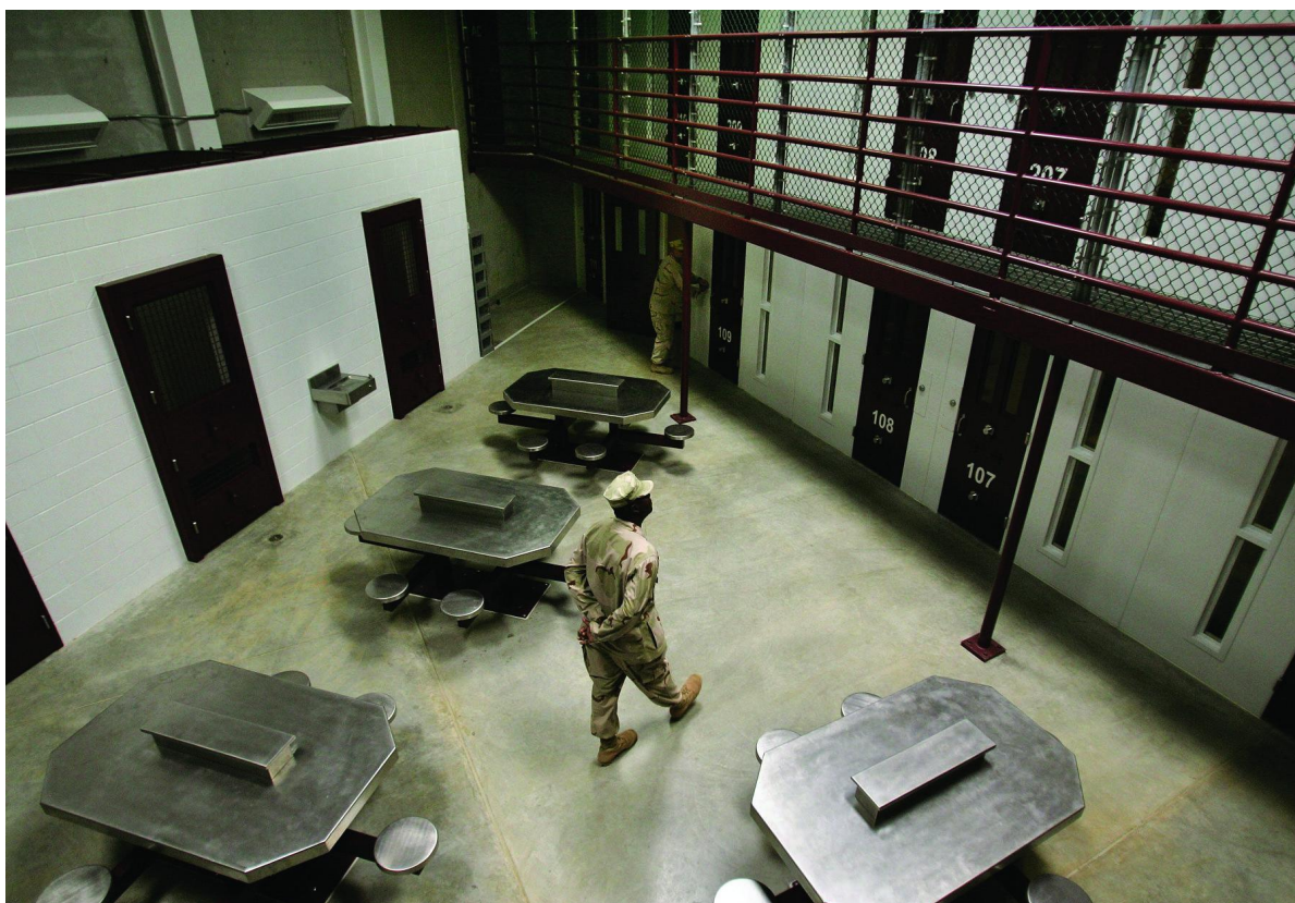
Guard standing surrounded by detainees' cells in what was intended to be a common area for detainees housed in Camp 6.