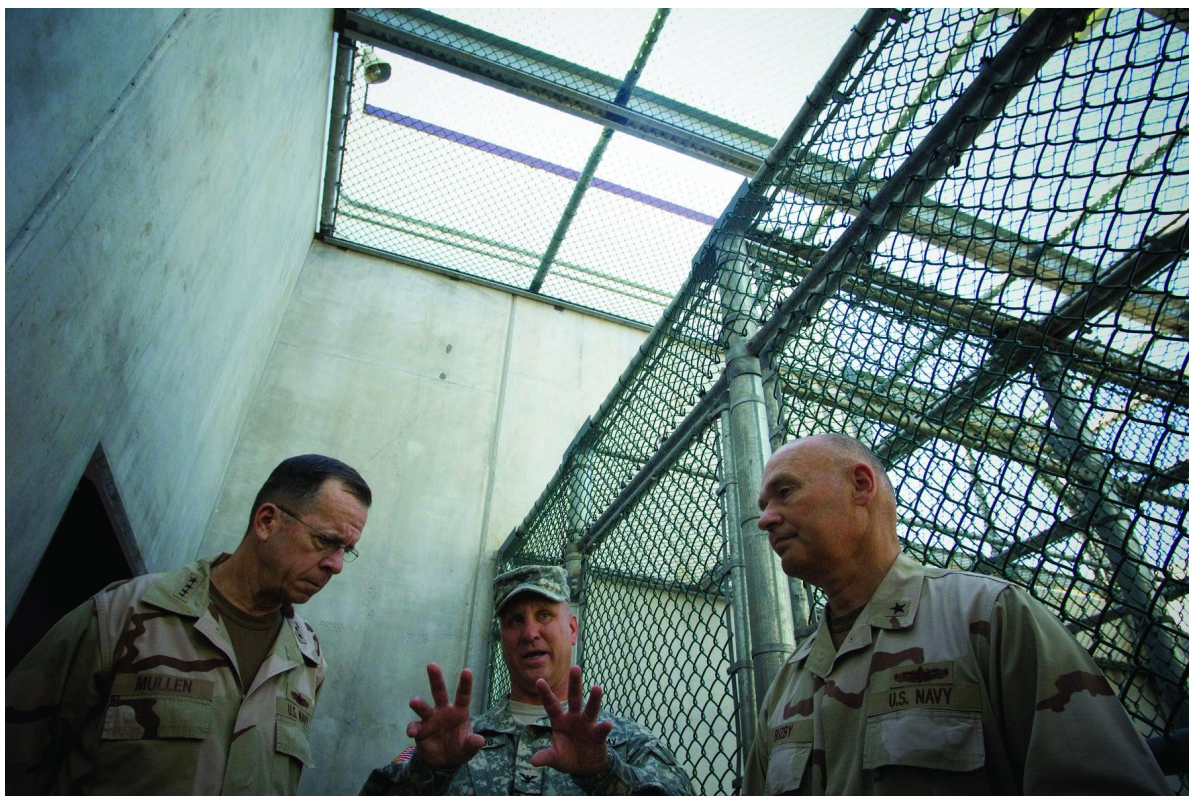
Camp 6 recreation area, surrounded by high walls.

They can only communicate with each other at recreation time or by yelling at each other through the gaps in their cell doors. 24