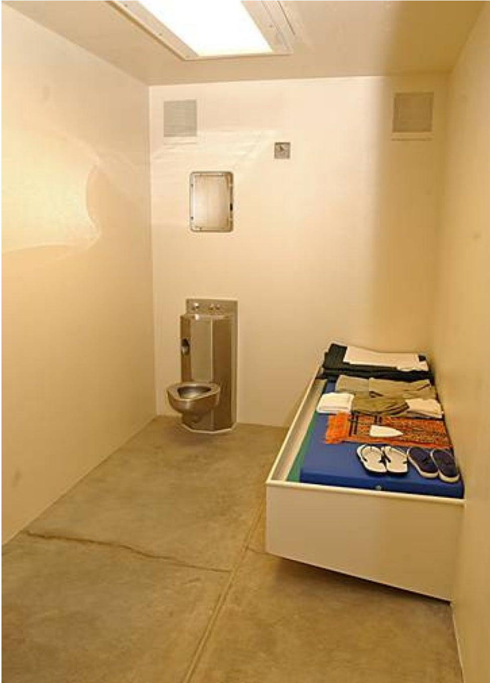
Cell inside Camp 6.