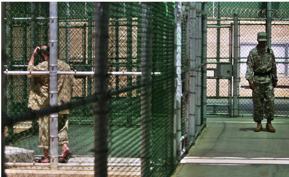
Recreation area, Camp 5.

Recreation—up to two hours a day—takes place either in individual 8-by-20-foot pens, or in 20-by-20-foot recreation areas that are sometimes used to hold two detainees at a time. 11 At least one detainee has told his lawyers that even in the larger pens they are forbidden from physically interacting with each other. 12