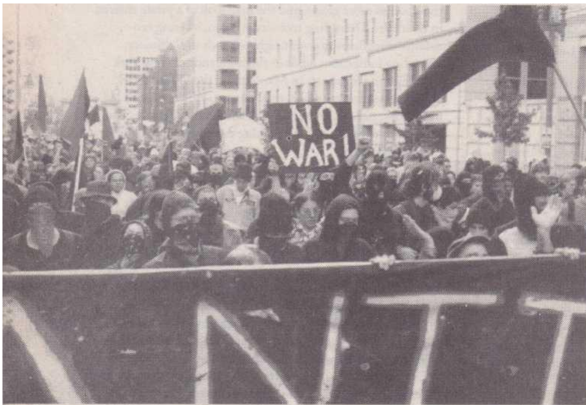
*The banner that nearl cost the White Shark its life!

from the IMF, the attacks on the World Trade Center and the Pentagon happened, and took even us aback. All the same, the White Shark was first and foremost a van of action, and while most of its activities after September 11 th are too dark too recount in the light of day, it did successfully ferry us away from danger. However, its hunger for blood is insatiable, and before we knew it, it was driving us right back to the meeting of the International Monetary Fund, which, despite the attack, had gone on. The White Shark dropped us off back at our secret anarchist hideout in the Capital, and we began preparing for what seemed to be one of the most frightening protests of our lives. It was clear this protest was no ordinary protest — and it wasn't going to be the North American version of Genoa we were all hoping for. No, this was testing the waters after a major terrorism attack and subsequent reactionary scare. The results of this test could be fatal as well, for now it was clear our government felt threatened and was looking for someone to lash out against. The bombing had just started on Afghanistan, and it was clear that one of the next things on their 'To-Do' list was to rid the world of those pesky anti-globalization protesters, especially the troublesome anarchists.