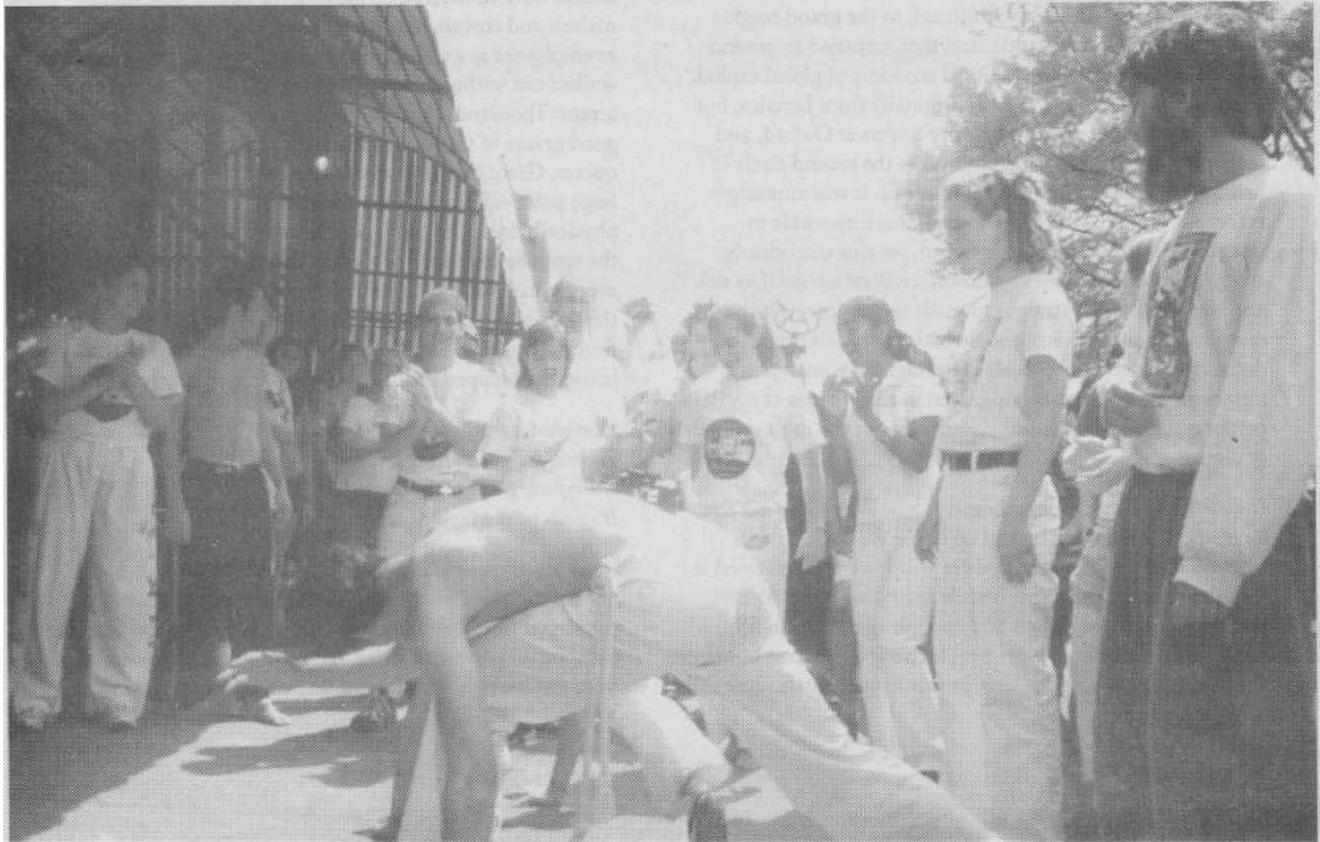
Reclaim the Streets breaks it down!

house I hadn't seen in months. It looked like a wreck: the windows were smashed out, the ever-creeping kudzu had slowly taken over the much of the broken TVs and bikes and other strange junk that littered the front-yard, and the crazed house appeared to be barely standing, laying somewhere on the strange edge between reality and madness, between enchantment and accursedness. I parked, and walked up to its spray-painted walls: stabbed into the front door was a knife, with a strange note beneath it. The note said, in a scrawled hand-writing that seemed familiar: Here is the ruin of our house, a place where we tried to live the Revolution that we all want. We have all left, so please come in and make your home. The hippie was absolutely shocked, having never seen an abode, even of anarchists, so utterly magical and yet utterly ruined. "It's like an magical anarchist hill-billy shack in the middle of nowhere..." I smiled and nodded. However, the inside of the house was so littered with broken fridge doors, yellowing books, and broken glass that we decided to climb upon the roof and sleep on top of it. From the roof, I looked down upon the valleys of kudzu that stretched out before me, and as the birds began to sing to greet the rising dawn, I felt implacably at home. I held her hand, and we fell into it, like a fever, like a dream.