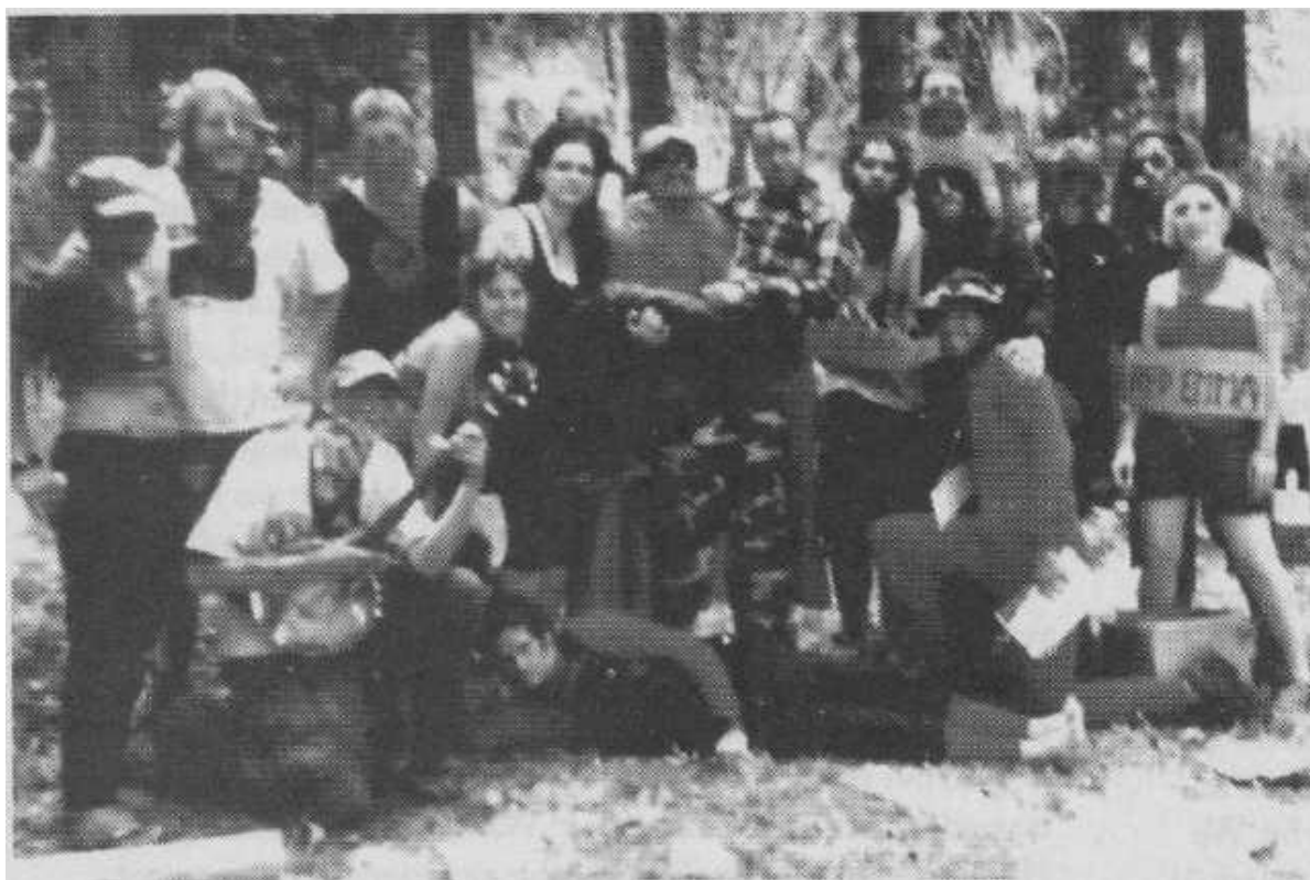
The cast of Eugenia and Wobbleo prepare to give the performance of their lives