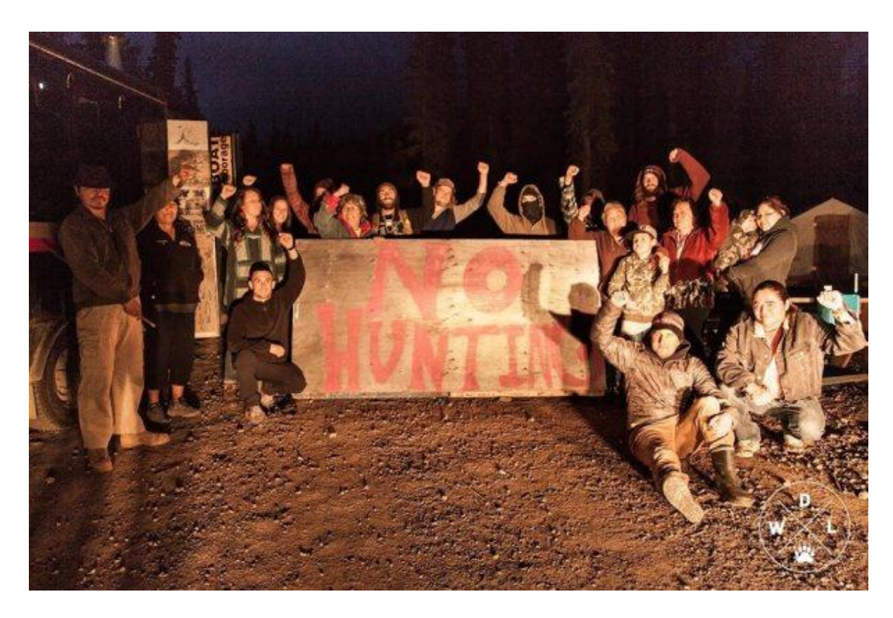
Tahltan hunting blockade