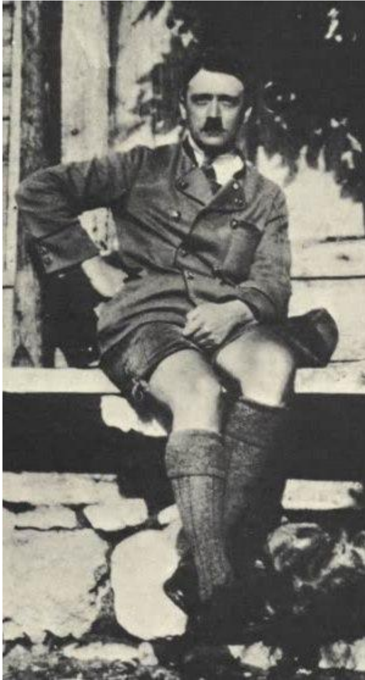
Hitler in Bavarian peasant garb.