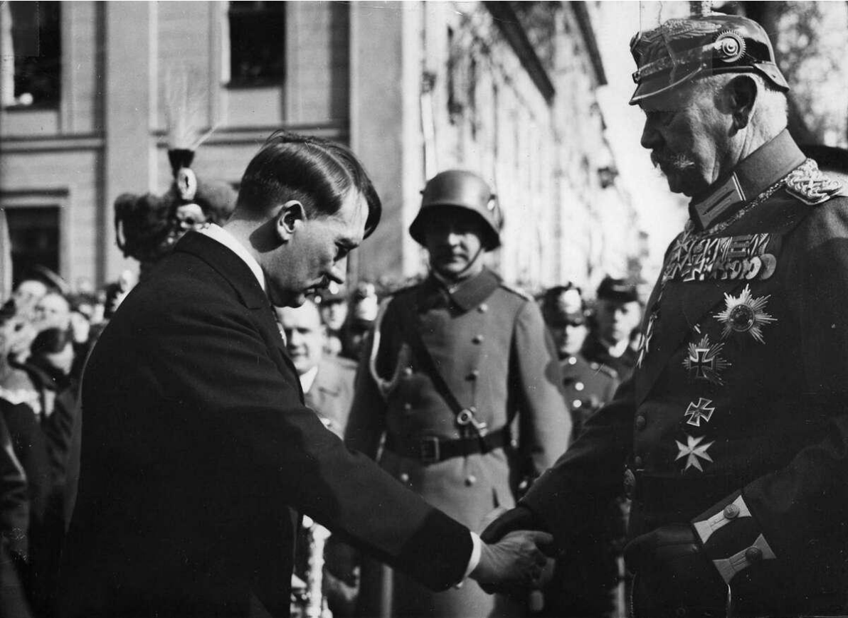
With President Hindenburg at ceremonies marking the opening of the Reichstag at Potsdam.