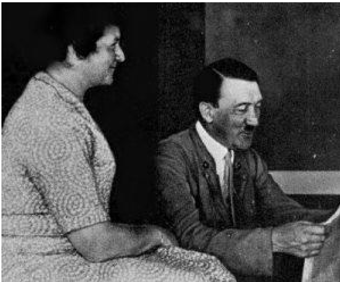
With his half-sister, Angela. "The only living relative Hitler ever mentioned."