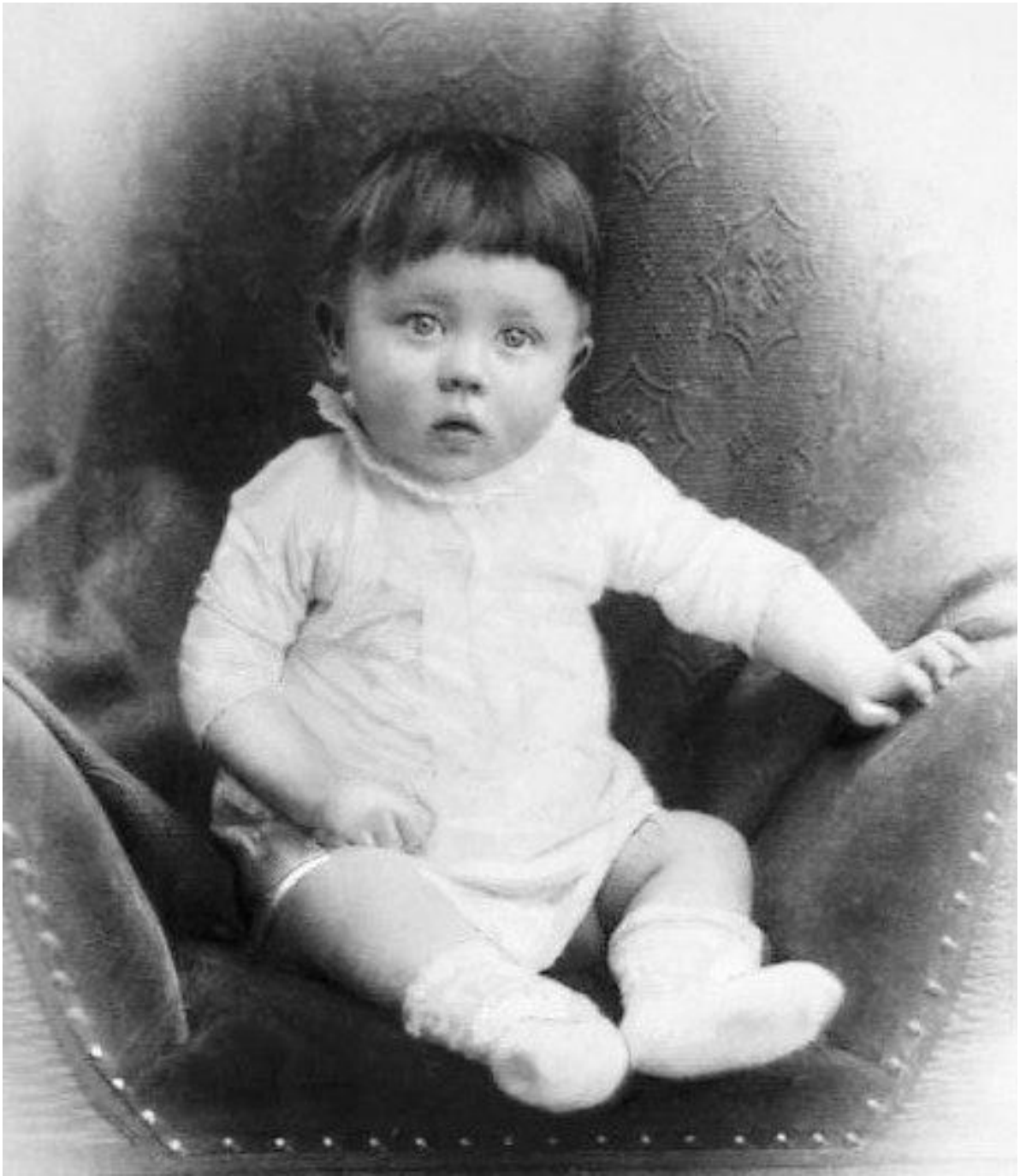
Hitler as an infant.