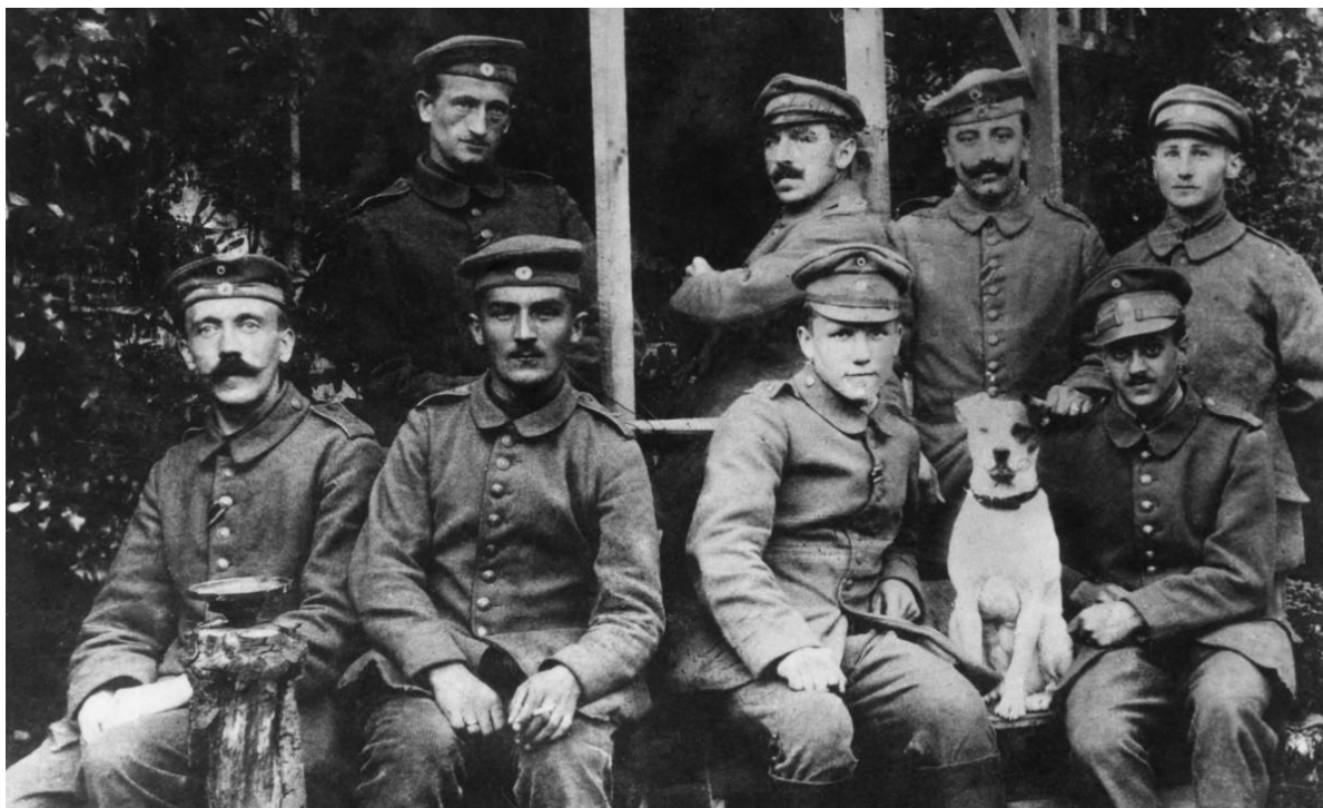
With wartime comrades (extreme left, front row).