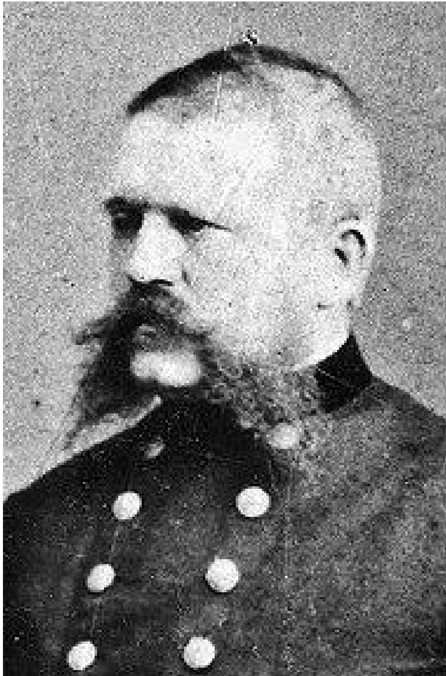
Father, Alois Hitler, the illegitimate son of Maria Anna Schicklgruber