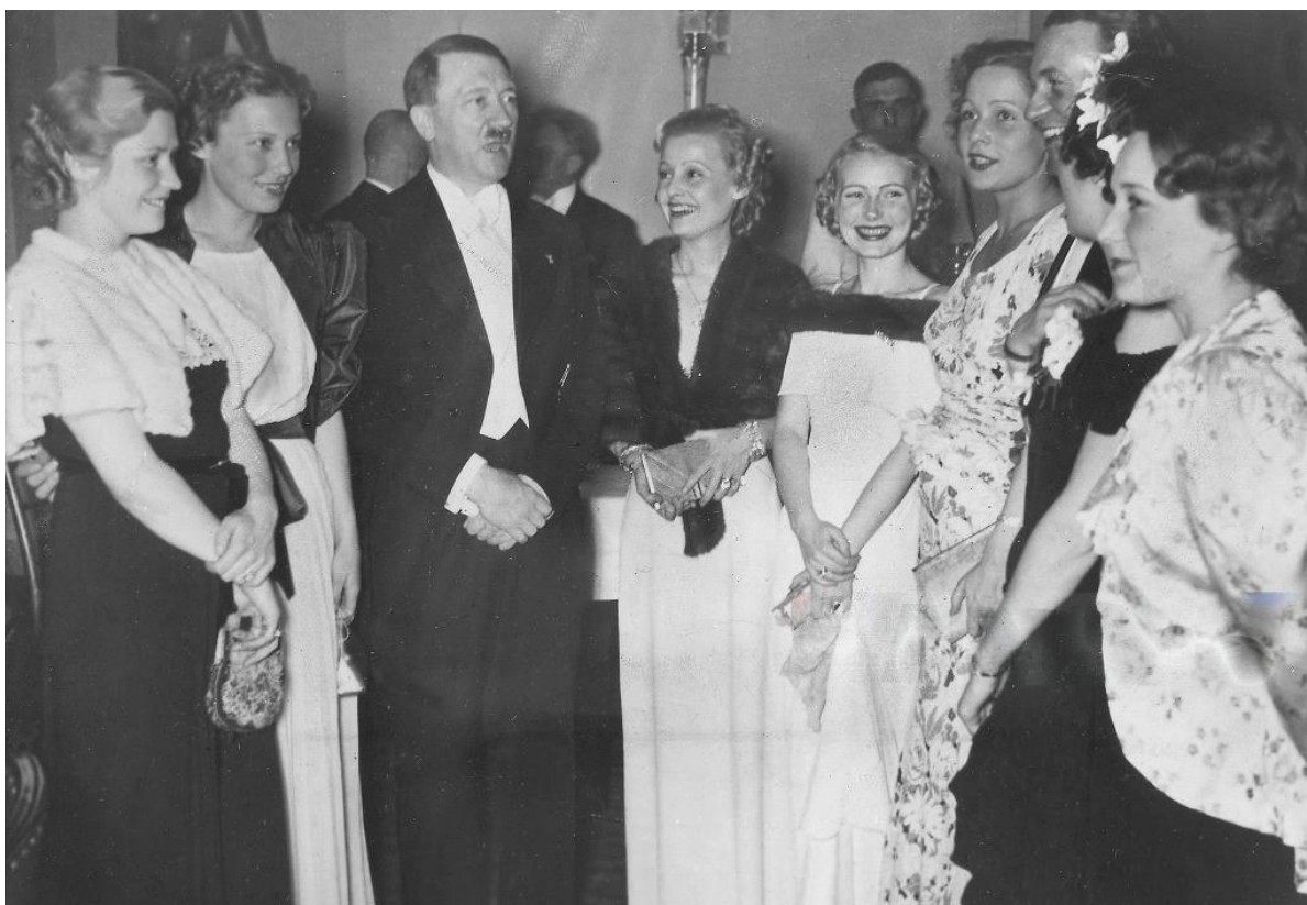
With favorite film stars—from left to right: Else Elster, Leni Marenbach, Hitler, Lilian Harvey, Karin Hardt, Dinah Grace, Willi Fritsch, Leni Riefenstahl, and Dinah Grace's sister.