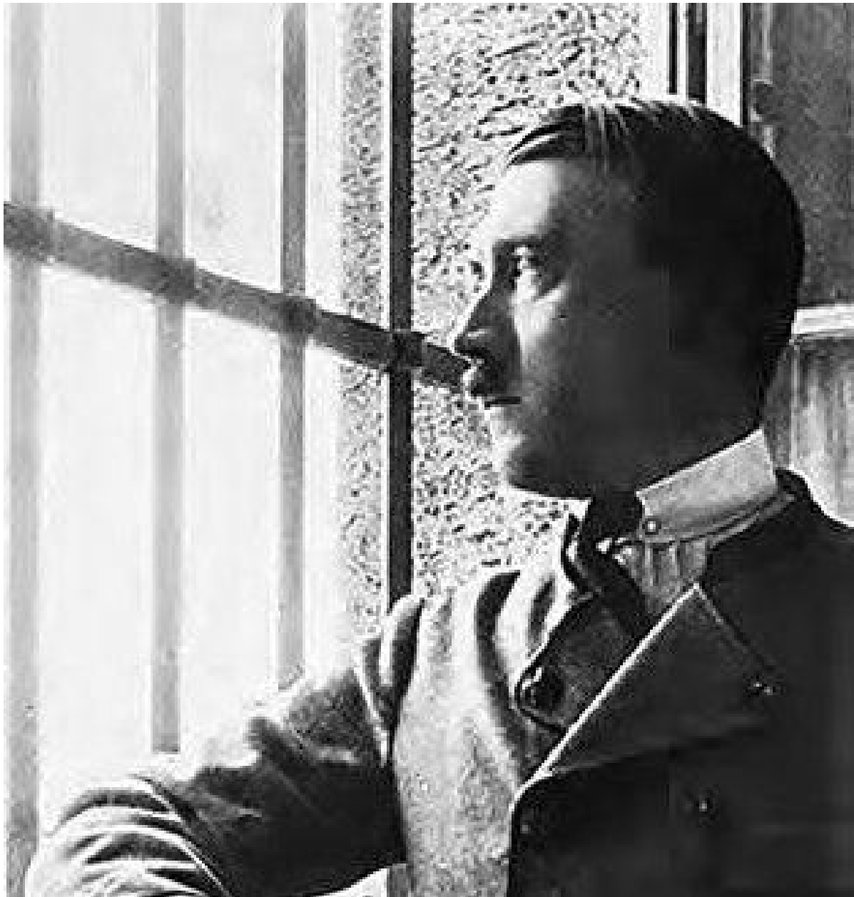
In Landsberg prison after the failure of the Putsch.