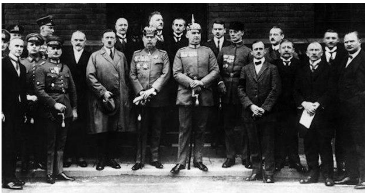
Hitler, Ludendorff, and other conspirators in the unsuccessful Beer Hall Putsch of 1923.