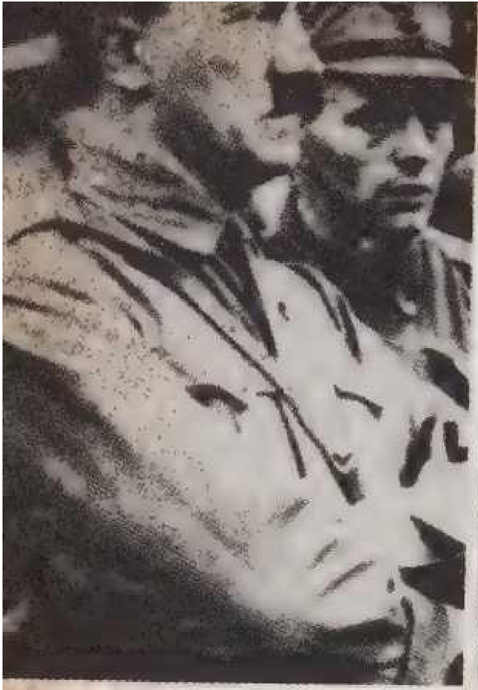
Reviewing an SA parade.