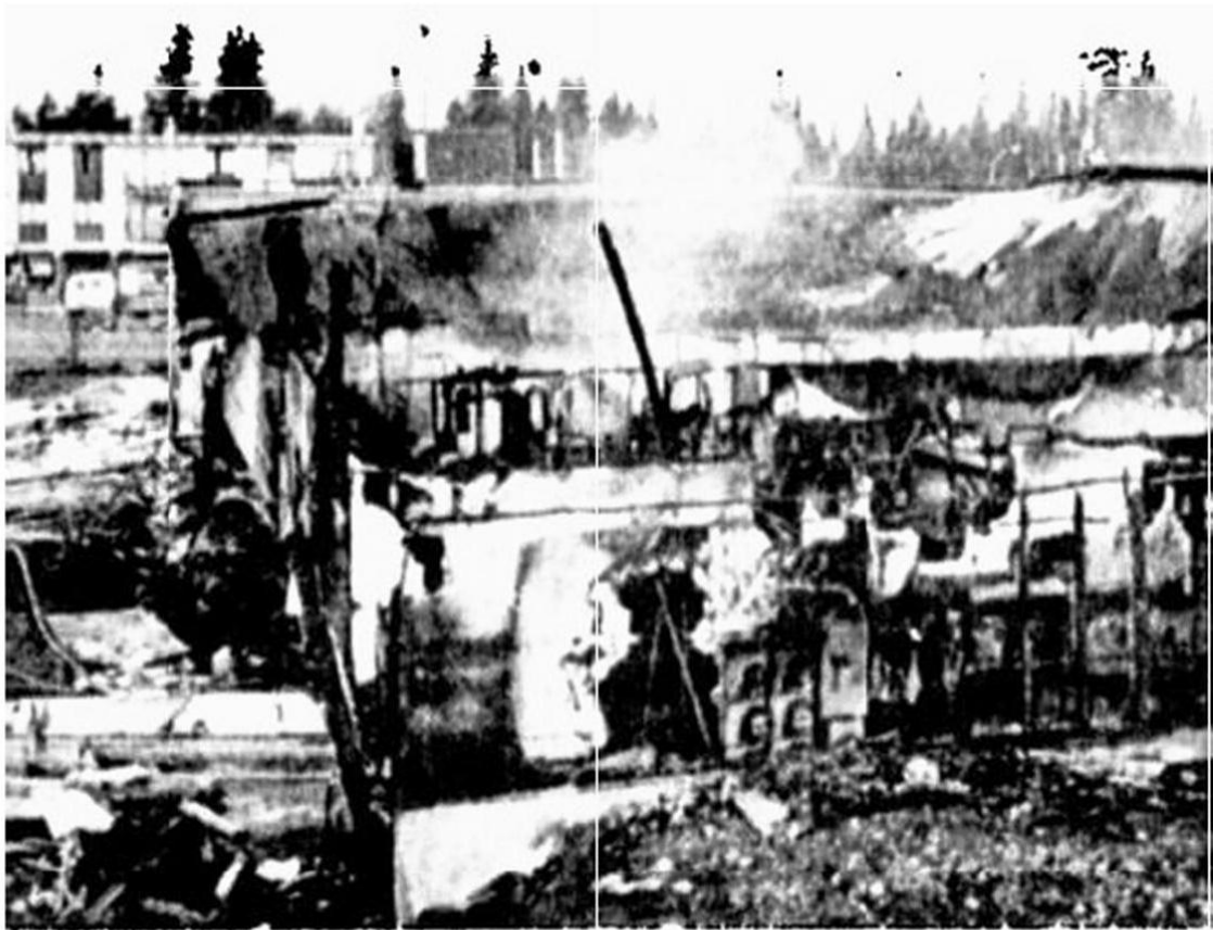
Surrey, B.C. video store lies in ruins follo