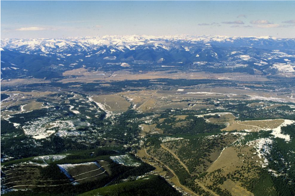
An aerial photo from April 1996 shows the area of Montana where Unabomber Ted Kaczynski was apprehended at his remote cabin.