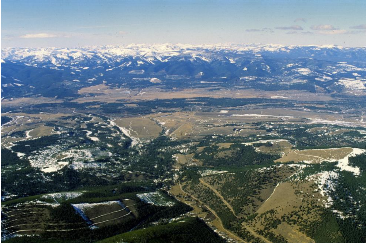
An aerial photo from April 1996 shows the area of Montana where Unabomber Ted Kaczynski was apprehended at his remote cabin.