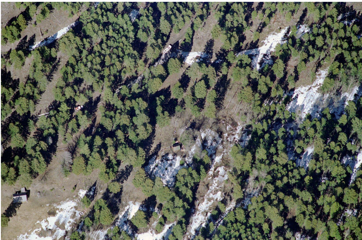
A 1996 aerial photo shows the property where Unabomber Ted Kaczynski lived. Kaczynski's cabin can be seen near the center of the frame.