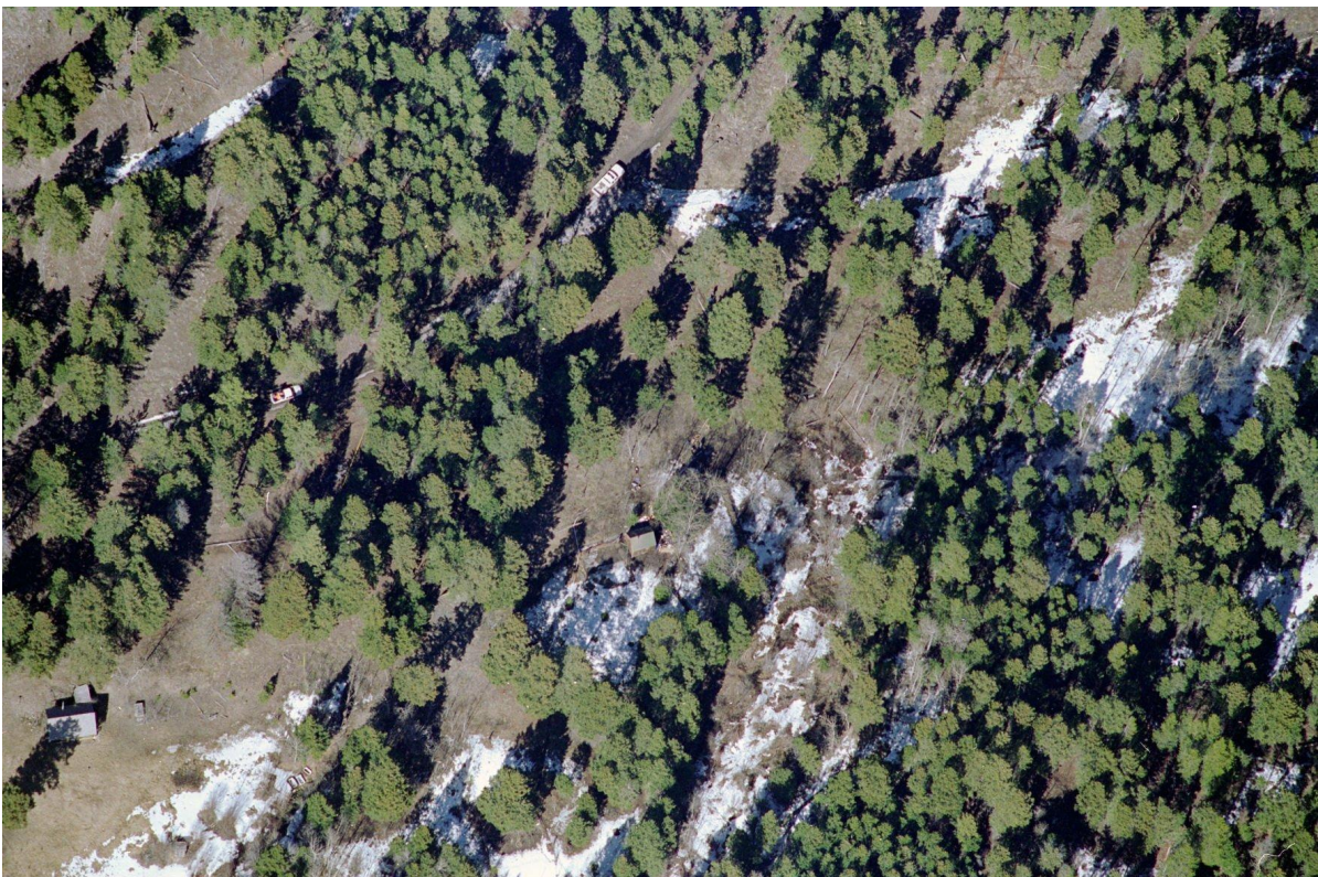
A 1996 aerial photo shows the property where Unabomber Ted Kaczynski lived. Kaczynski's cabin can be seen near the center of the frame.

Two photos by Larry Mayer of the Billings Gazette from 1996: