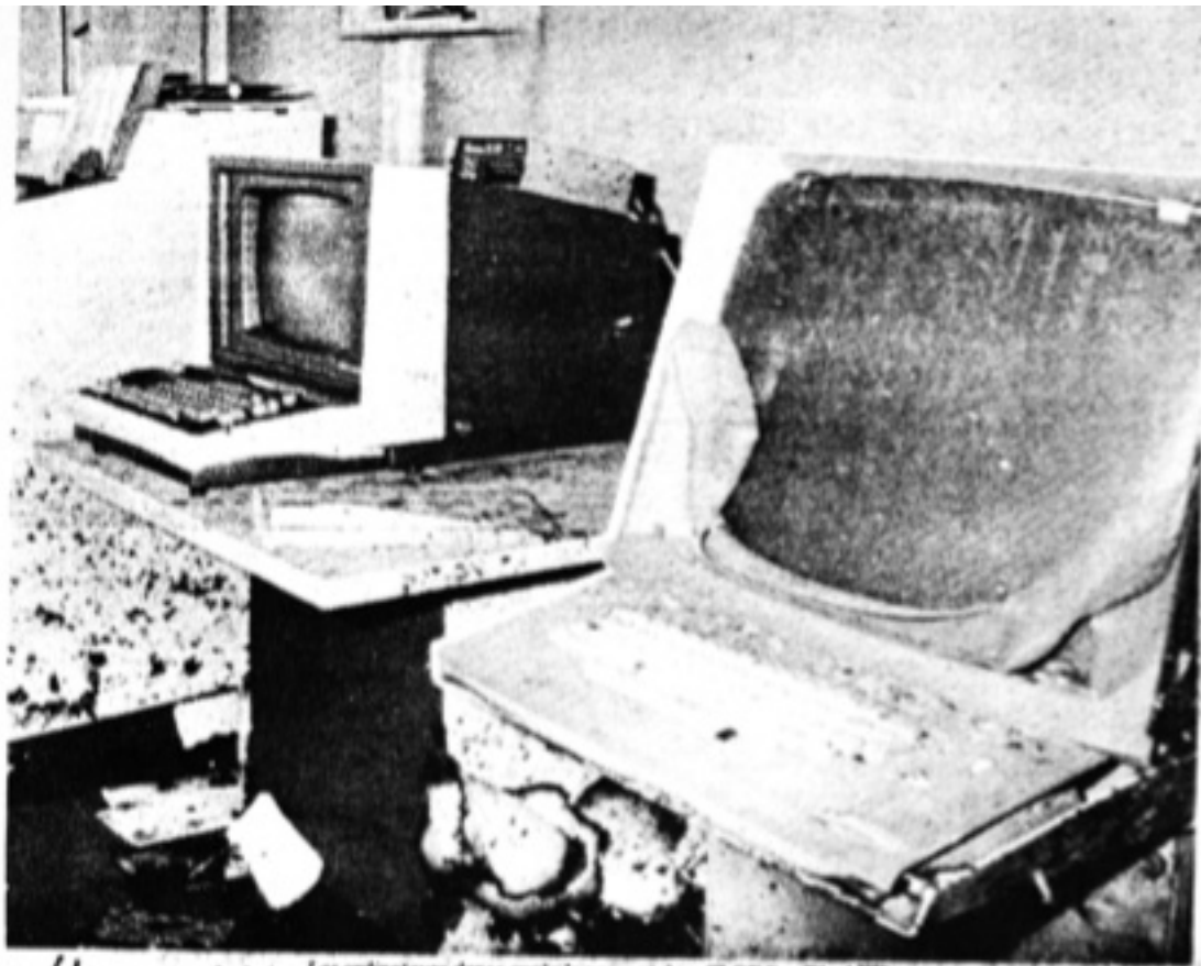
Les ordinateurs danses après le passage du « CLODO » à l'APP.