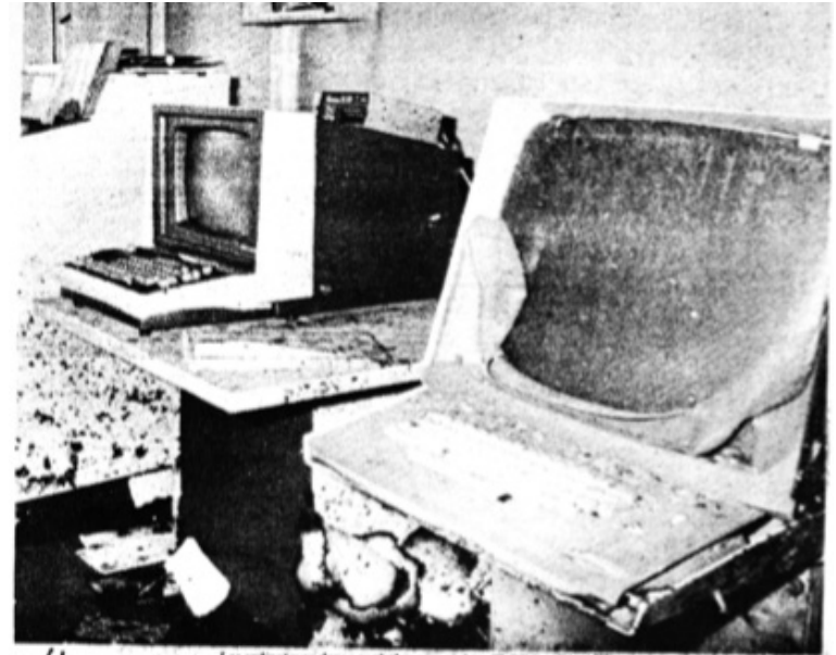
Les ordinateurs dans après le passage du « CLODO » à PA. APP.